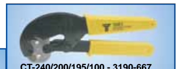
CT-240/200/195/100 - 3190-667