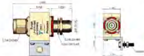
• LP-BTR-NMS 20-1000MHz DC Blocked N Type M on Surge